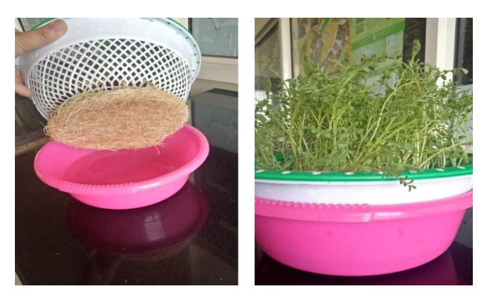
Fig. 1: Profuse Rooting and shooting growth of Cicer arietinum seed on 10<sup>th</sup> day of hydroponics experiment in nutrient solution.

Seeds of chickpea were soaked in water and solution